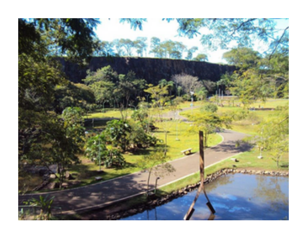
Pref. Dr. Luiz Roberto Jábali Park / (Curupira Park) – Opened in 18th December 2000, the environment complex is the largest leisure area from the city. There are 152 thousands m² with artificial lakes, waterfalls and paved trails that can be ridden on foot or by bicycle. There is a great tropical forest in the area with a variety of birds and little mammals. It is open daily from 6am to 7pm Address: Av. Costábile Romano, 337

Metropolitan Cathedral - When the cathedral at XV November Square was put down, this new one was built, and then founded in 1920. Stylized in romantic and gothic lines, its main attractions are the colored glasses in the window and the paintings inside from Benedito Calixto, dated from 1817. It's located downtown, in front of Praça das Bandeiras, which presents people a craft fair on weekends.