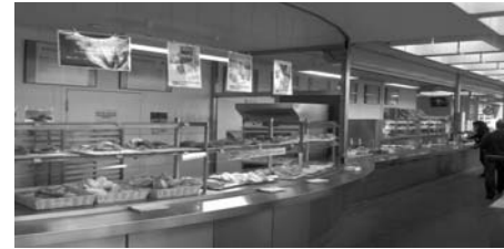
Cafeteria of the Studierendenwerk at Ulm University