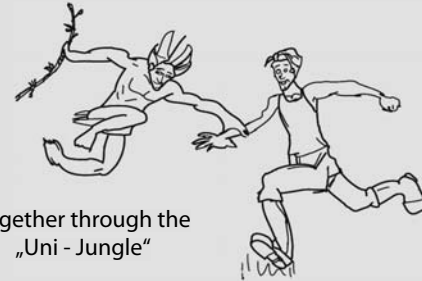
Together through the „Uni - Jungle“

Are you going to pursue a degree (Bachelor/Master) in Ulm or Neu-Ulm? Or you would like to find a person who advises you personally and individually about the degree programme and life in Ulm? If so you may consider joining the „Buddy Programme“.