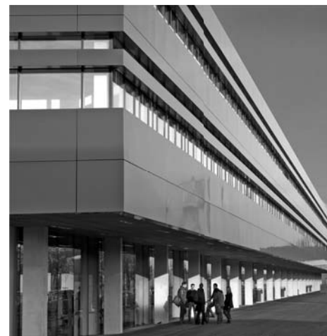
University of Applied Sciences Neu-Ulm

Opening hours: Mon – Thu: 09.00 a.m. - 7.00 p.m. Fri: 09.00 a.m. - 5.00 p.m. Every second Saturday: 10.00 a.m. - 2.00 p.m.