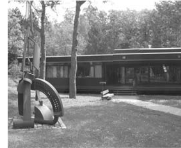
Ulm University, Pavilion I, International Office