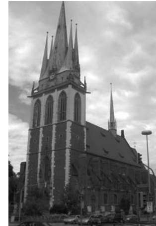
Church St. Georg, Ulm Oststadt