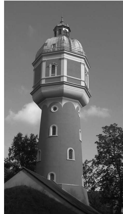
Landmark of Neu-Ulm, the Wasserturm (water tower).