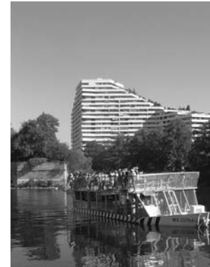
Boat Trip on the Danube river