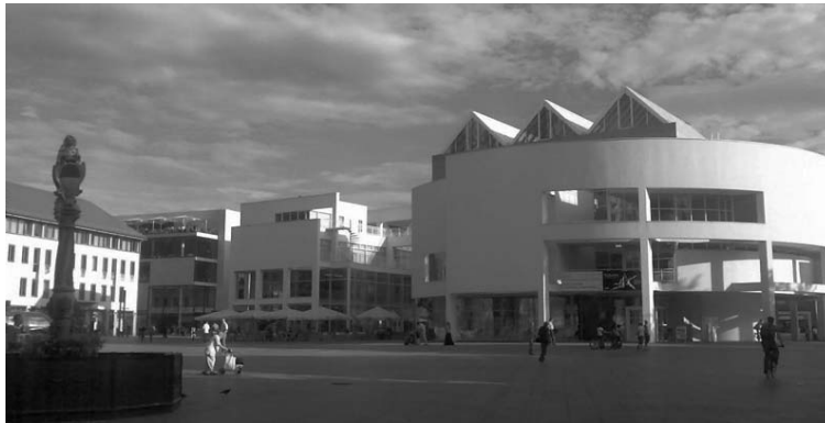
The Stadthaus at the Münsterplatz, a postmodern building close to the gothic minster.

With a total of 170.000 inhabitants, the swabian twin cities are manageable. Everything is close and will seem familiar in no time. The Danube river officially divides the two federal states Baden-Württemberg and Bavaria. Ulm, the bigger of the two cities with 120.000 inhabitants, is located in Baden-Württemberg and directly borders the smaller Bavarian city of Neu-Ulm on the other side of the Danube river. The two municipal authorities work hand in hand in many sectors. They have grown into a comprehensive economic and cultural space and form the centre of the region between Allgäu and the Swabian Alb.