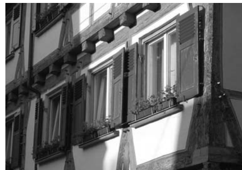
Historic part of Ulm