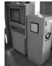
Mail box and vending machine