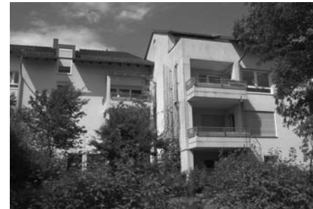
Student Residence Kelternweg

www.studentenwerk-augsburg.de/english/housing/wiley_Eng.php