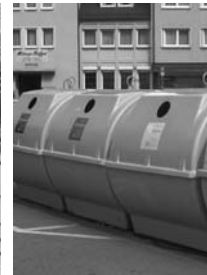
Glas containers in Ulm