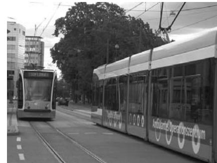
Tram in Ulm

The semester ticket is valid within the whole DING area for the duration of a full semester. The price is currently 105,00 € per semester. All registered students of Ulm University, Ulm University of Applied Sciences and the University of Applied Sciences Neu-Ulm are entitled to buy it. If you register in Ulm for the first time, you will get one free semester ticket from the city.