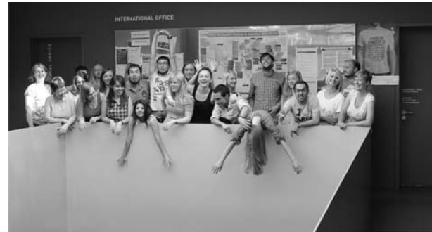
Team of the International Office of University of Applied Sciences Neu-Ulm