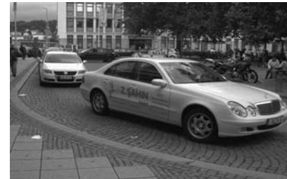
Taxis at the main station in Ulm