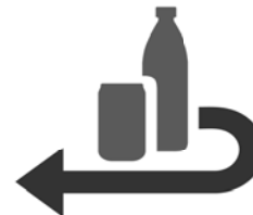
Logo of the DPG Deutsche Pfandsystem GmbH

For all „light“ plastic and metallic packing materials, such as yoghurt cups, plastic bags, styrofoam, milk and juice packs, cans, spray cans, that may carry the symbol „der Grüne Punkt“ and are not mentioned somewhere else. Make sure everything is completely empty. You can pick up yellow (plastic) sacks at the recycling stations or in the Bürgerbüro of Ulm or Neu-Ulm (Chapter 4).