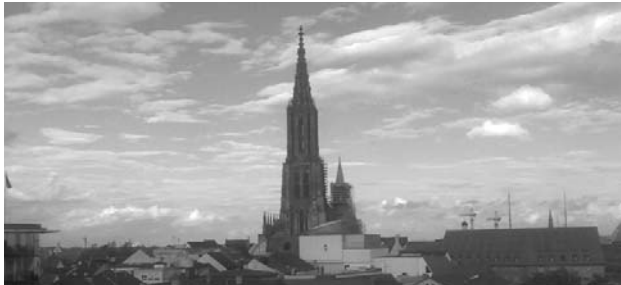
With its 161,53 m, the Ulm Münster has the world's highest church steeple.

The Danube river and the Swabian Alb with many touristic destinations are located close to Ulm and Neu-Ulm. From the steeple of the Ulm minster, you have a breathtaking view of the twin cities, in clear weather actually stretching to the Alps. These mountains are the ideal place for skiing and snowboarding in winter time. Both the Alps and Lake Constance are only a one-hour car-ride away. Bigger cities with airports, like Munich and Stuttgart, are reachable within the same time.