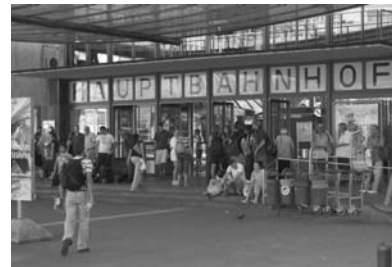
Main entrance of Ulm main station