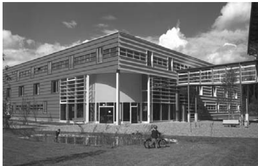
Main library of Ulm University

Bibliotheks-Zentrale Universitaet West Albert-Einstein-Allee 37, 89081 Ulm ☎ +49 (0)731 / 50-15544 www.uni-ulm.de/einrichtungen/kiz/bibliothek.html