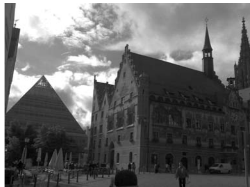
Library and town hall

Besides cinemas, theatres and museums, Ulm and Neu-Ulm offer a broad range of leisure activities: rowing, boat trips and ice-skating are very popular. In summer, quarry lakes in the city surroundings invite for a swim. In that season, Ulmer Zelt (Ulm Tent) stands for a varied entertainment programme with political cabaret, comedy, rock and jazz. The open air concerts on the Münsterplatz have become famous for their live acts during the Oath Week. Afterwards, you can explore the many bars and clubs to turn night into day.