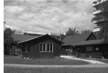
Musisches Zentrum, Ulm University

Although most of the artistic and musical activities take place at Ulm University, it is also possible for students of Ulm University of Applied Sciences and the University of Applied Sciences Neu-Ulm to participate. Just ask. Talented students are always welcome!