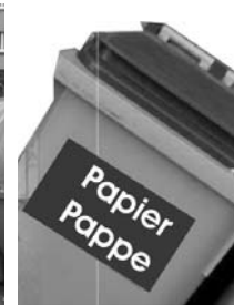
Blaue Tonne in Ulm