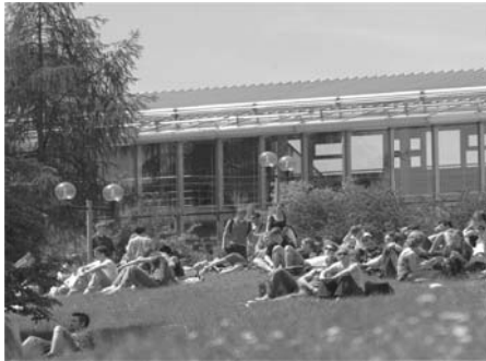
Students in front of Ulm University, Southern Entrance