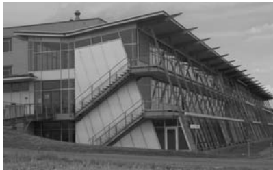
Location Oberer Eselsberg