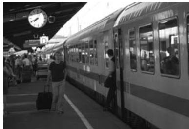
Arriving at Ulm main station (Hauptbahnhof)

You find more information on these topics in chapter 4 and 5 of this brochure. The International Office of your university can give important advice concerning all formalities you have to handle at the beginning of your studies in Ulm/Neu-Ulm. Furthermore, you can get valuable hints about living and studying in Ulm/Neu-Ulm that may help you to feel comfortable soon. Therefore, you should make use of all the information and orientations offered by the International Office upon Your arrival at the university.